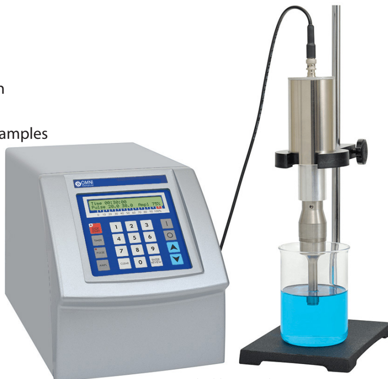
Stand sold separately.