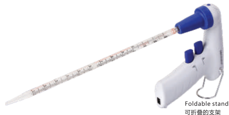
Foldable stand 可折叠的支架