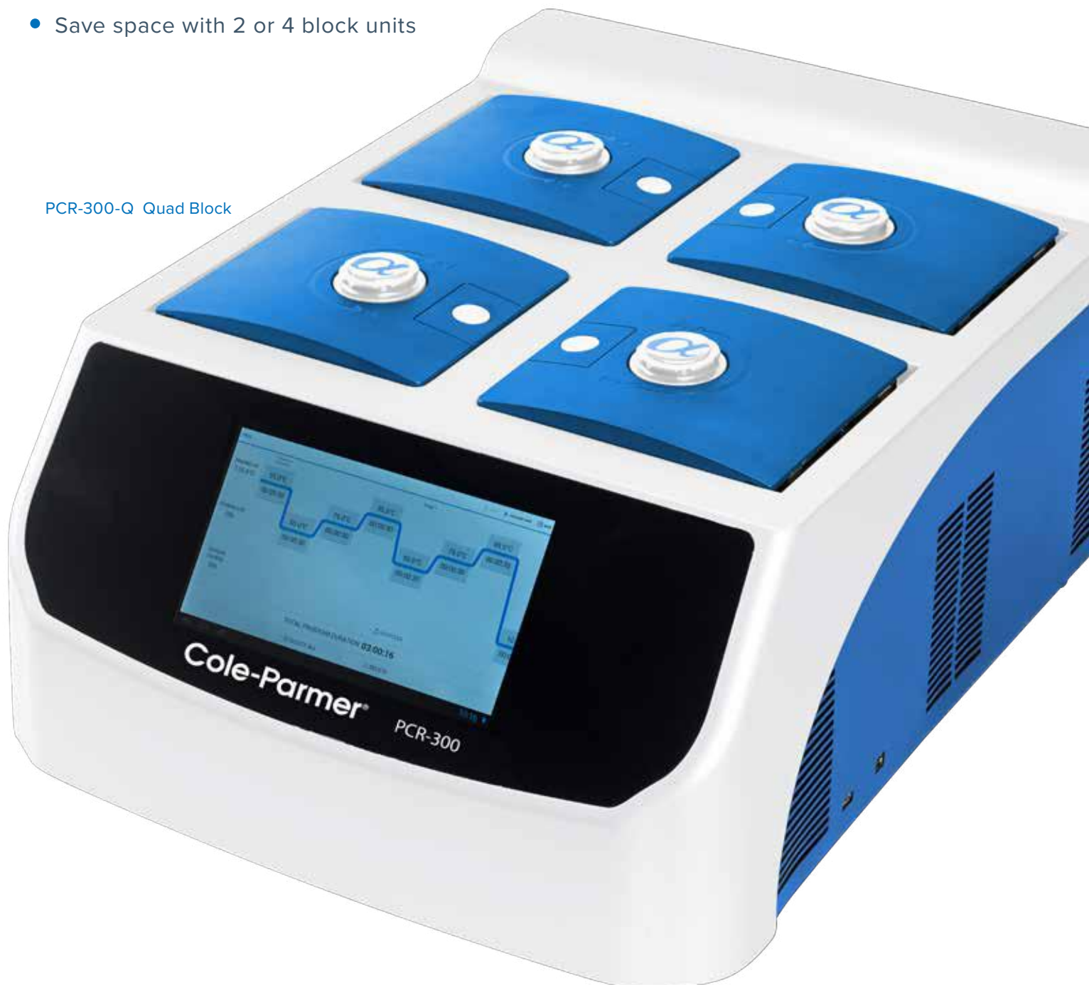
PCR-300-Q Quad Block