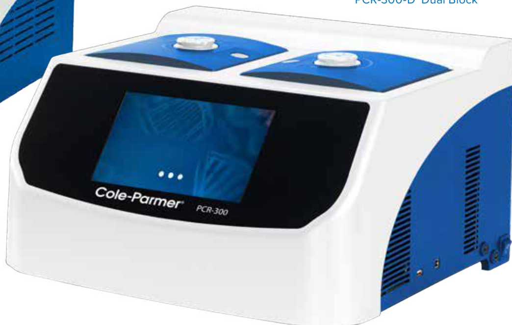
PCR-300-D Dual Block