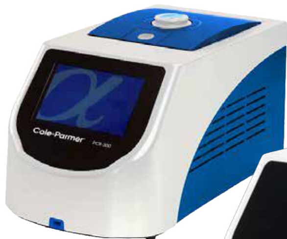
PCR-300-S Single Block

The Cole-Parmer PCR-300 Alpha Cyclers are developed to deliver not only the best quality data you can expect from a thermal cycler but also to innovate and exceed the high standards expected by the community. With options of either one, two or four independently controllable blocks, the PCR-300 is a platform which scales to the throughput of the laboratory. With programs easily transferable between any PCR-300 instrument and user specific defaults stored on the user's USB login device (any USB drive can be programmed as a login device) there are no issues with transferring work between systems or collaborating/sharing across multiple sites.