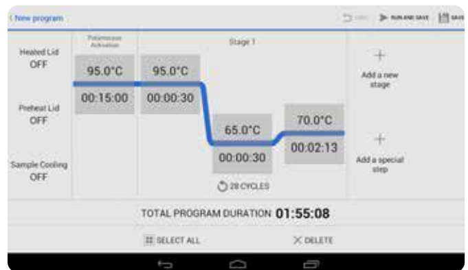
Live Progress view

Program Wizard also allows for high-specificity touch-down PCR and will accommodate for GC/AT imbalances in the target sequence to produce optimal Tms and hold times.