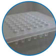
Convenient 48-well format meets the throughput needs of most researchers