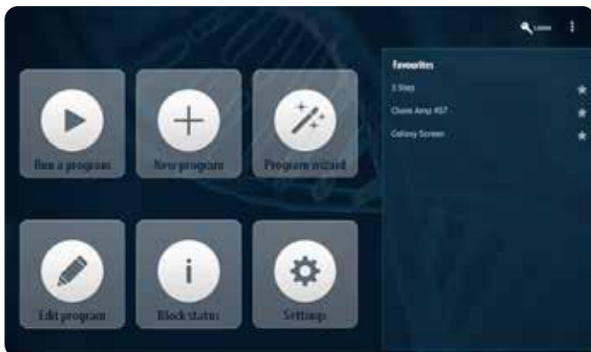
Program Interface Home Screen

All PCR-300 Alpha Cyclers are driven by the same software allowing for simple use and transition between instruments for both users and protocols. The intuitive Android interface makes the system easy to use with minimal to no training. The home screen below highlights the clear and simple to follow nature of the PCR-300 software.