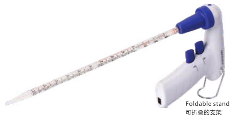
Foldable stand 可折叠的支架